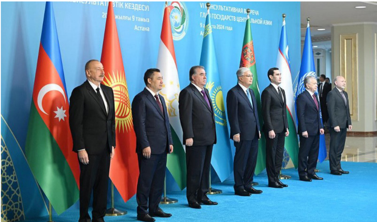
Leaders of the C5 and Azerbaijan at the 6th Consultative Meeting of the Central Asian States in Astana