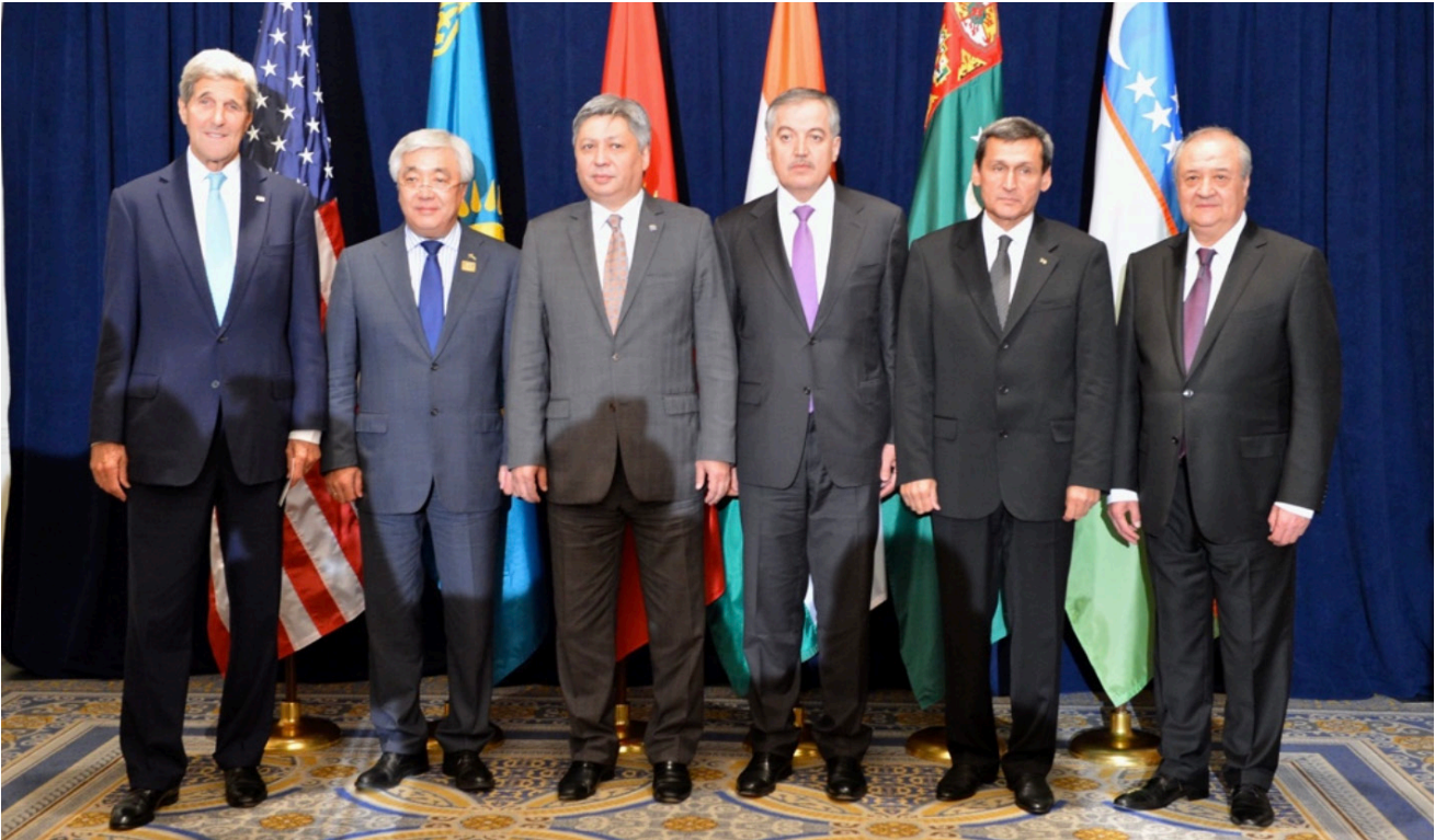
The first ever C5+1 Meeting Between Central Asian Foreign Ministers and Secretary of State John Kerry