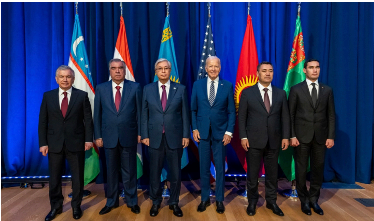
President Joe Biden's Meeting with C5 Leaders at UNGA

Nevertheless, hope springs eternal and the U.S. creation of the C5+1 in 2015 during the administration of President Barack Obama was a very positive step forward, as was President Joe Biden's meeting with the C5 leaders in New York City on the margins of the 2024 UN General Assembly. These kinds of group meetings are certainly welcome and should continue; however, individual meetings send a stronger signal about U.S. interest in, and commitment to, the region.