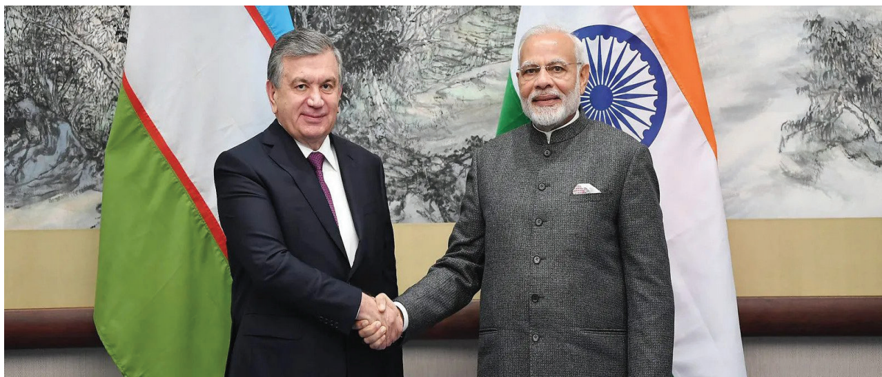
Modi meets with Mirziyoyev during the 2018 Shanghai Cooperation Organization summit.

Increase Security Engagement with Uzbekistan. Uzbekistan President Shavkat Mirziyoyev has expressed his intent to stamp out extremism from Uzbekistan and a desire to stabilize Afghanistan. 57 India should strengthen security engagement with Uzbekistan to halt religious extremism and further mold its security role in the region.