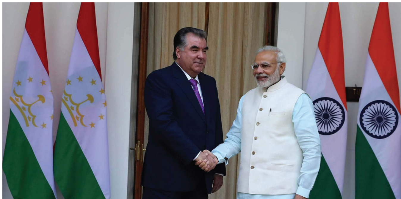
Tajik President Emomali Rahmon and Indian Prime Minister Narendra Modi at a 2017 state visit.

India's experience in transforming security cooperation into a multi-dimensional relationship with Tajikistan has allowed it to seek similar relations with other Central Asian countries. Between 2014 and 2020, there were 18 ministerial, executive, and cabinet-level visits between Indian and Central Asian officials to discuss a myriad of issues, such as advancing technological cooperation, formulating joint business councils, and financing critical infrastructure projects. 10