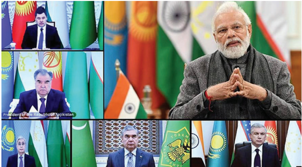
Modi speaks with the Central Asian leaders at the India–Central Asia Summit.

India can also take advantage of festering adverse relations between the Central Asian countries and China. Residents of Kyrgyzstan have staged numerous protests opposing Chinese-led infrastructure projects in the country 35 , and Kazakhstani university students enrolled in Chinese schools have reported feelings of uncertainty when transiting at the Xinjiang airport. 34 Kazakhstani citizens who previously held Chinese citizenship have been arrested while on business trips in China, adding to the sense of unease for Central Asians residing in China. 35 India can offer its own investment and credit lines to Central Asia that come with less geopolitical baggage than China's BRI projects. In 2020, India announced it would provide Central Asia with an additional $1 billion line of credit intended for broadening the connectivity partnership between India and Central Asia. 36 Projects like these display India's eagerness to play a deeper role in developing Central Asia's infrastructure to counter China in the region.