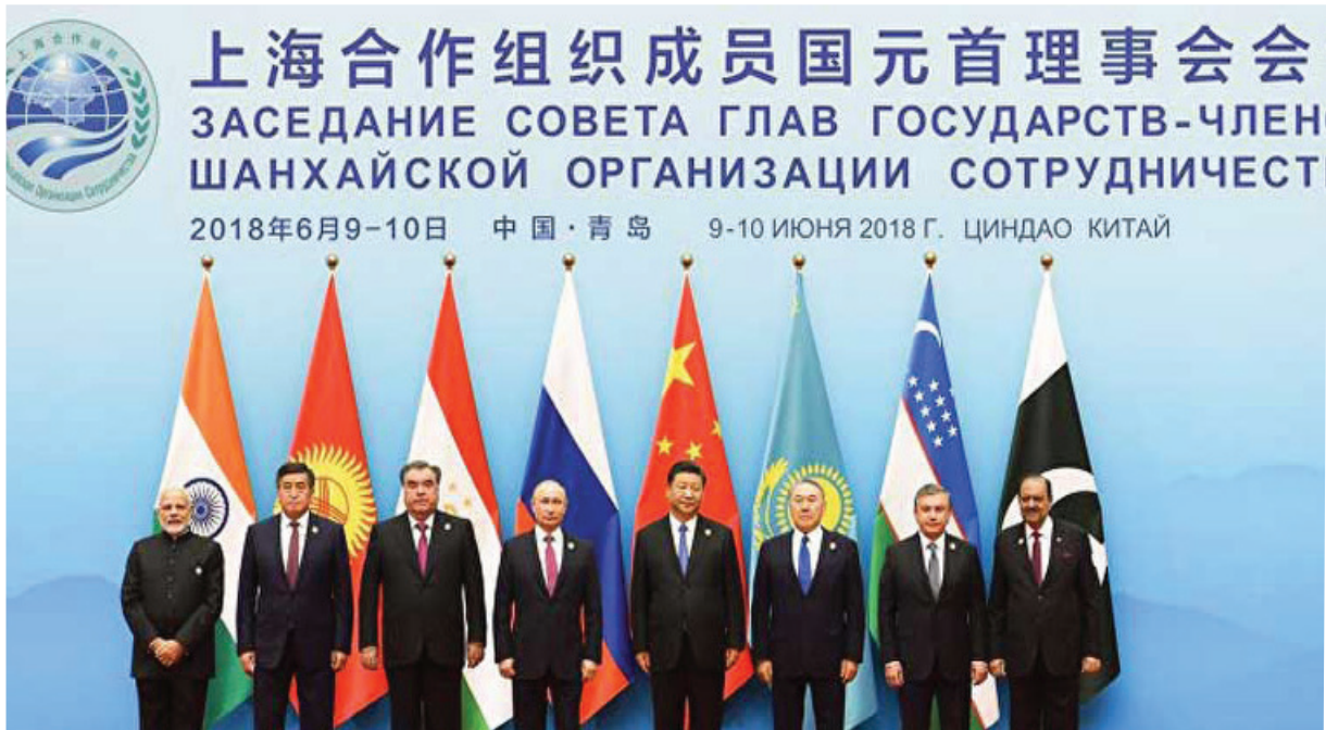
Leaders of countries in the Shanghai Cooperation Organization pose at the 18th SCO Summit in 2018.

In addition, India hosted the first ever India-Central Asia Summit virtually in January 2022. The format resembled Chinese forums that are held with the five Central Asian republics. In the summit, the leaders of India and the Central Asian countries discussed the establishment of an India-Central Asia Center, which would manage relations between India and the region. There was also a focus on improving trade, investment, and connectivity between South and Central Asia. Last, security and defense cooperation were at the forefront of the meeting. Participants spoke of the importance of hosting joint counter-terrorism exercises and supporting a Joint Working Group on Afghanistan. 31 The India-Central Asia Summit was held two days after the China Plus Central Asia meeting, which focused on expanding trade, investment, and security assurances between Beijing and the Central Asian republics. 32 The back-to-back summits indicate that China and India are vying for economic and security influence in Central Asia. While China seeks to maintain and grow its prominence in the region, India is aiming to gain a foothold with the promises of less-controversial investment and security guarantees.